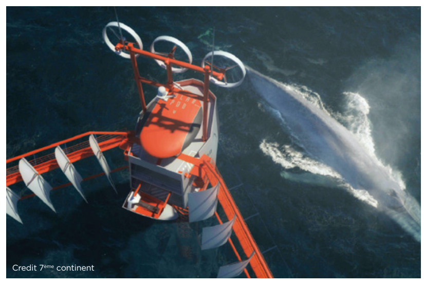
The expedition will provide valuable information on polar fauna and the ability of the Antarctic Ocean to absorb carbon dioxide.

In partnering with the expedition, Mersen is proud to contribute its energy management and power electronics expertise to ensure the Polar Pod platform's optimal autonomous performance.