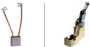
Carbon brushes & brush-holders for extracting ventilators