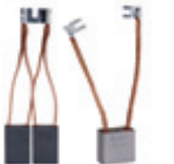
Carbon brushes & brush-holders for conveyors